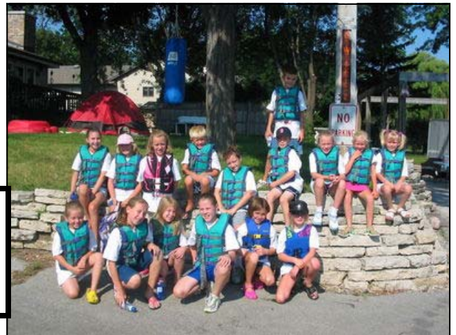
Typical group getting ready for another Cops and Bobbers outing. Lined up at Smokey's Musky Shop and assigned boat colors and already following directions. Hope we can do this next year if the Pewaukee Police are still around.