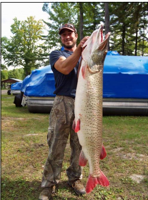
Possible new state record in Michigan 55 inches (don't know more details).

Have a great Fall Season, See you at the meetings. Put them on the calendar.